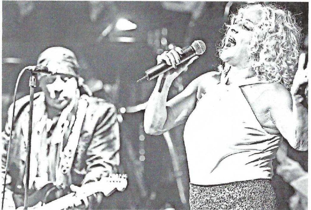
Darlene Love, with Steven Van Zandt at left, in a 2015 performance at Paramount Theatre in Asbury Park. She'll be at the Sugar Loaf Performing Arts Center in December.

Other dates include 8 p.m. Sunday, Nov. 28 at the St. George Theatre, 35 Hyatt Street, Staten Island, New